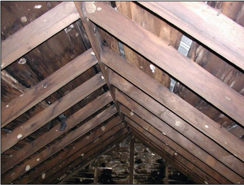
Picture showing the construction of the roof, still pretty solid after all these years. This roof was put together with wooden pegs shown left. These pegs held together the beams of the roof.